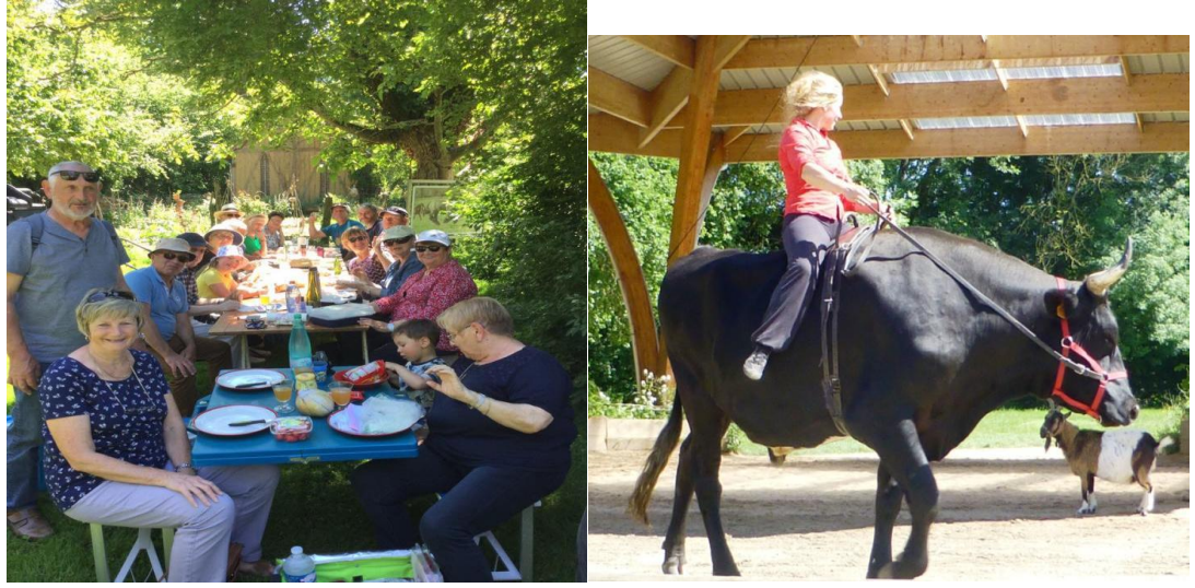
Picnic in the park Riding a bull

It was good to see old friends and meet new. Across the group of participating French and English members this time, ages ranged from seven to mid-80s. It is a wonderful way to experience French family life and the friendships made are sincere and long-lasting. We welcome new members – individuals, couples and families – and try to match people appropriately. You don't have to be able to speak French, though if you want to practise, it's a great opportunity. Many of our French friends speak English and language seems to be no barrier to firm friendships